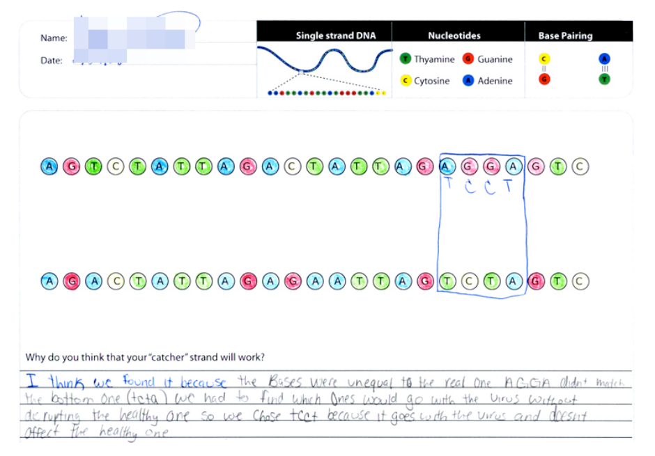
Figure 1. Student proposes 'catcher' strand (T-C-C-T) that uniquely selects target strand (top) without capturing non-target strand (bottom).

Three representations of DNA were constructed. In the simplest, paper-and-pencil version, DNA was represented as a rigid, linear chain of nucleotides (Figure 1), with the goal of establishing the overall component structure and base pair nucleotides. A second model employed plastic "pop beads," color-coded by base type, into which we attached polarized magnets and Velcro fragments (Figure 2). This representation was intended to reflect the differential binding properties of the base pairs and the flexibility of the DNA strands. The final model was a computer graphic simulation in which DNA was depicted as large groups of strands of (color-coded) nucleotides moving in a liquid medium (Figure 3); here the purpose was to highlight the dynamism of DNA, the attractive forces governing self-assembly into paired strands and the capacity of changing an environment and without direct manipulation. (The computer simulation was implemented as a whole-class resource, projected from an overhead projector to a 6-foot diameter platform on floor of the classroom.)