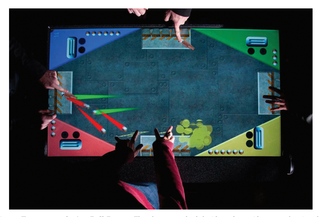
Fig. 4. Four users playing Ball Buster. The players on the left side and top side are performing the shooting gesture, while the player on the bottom is using the two-finger tap gesture to create two separate barriers.