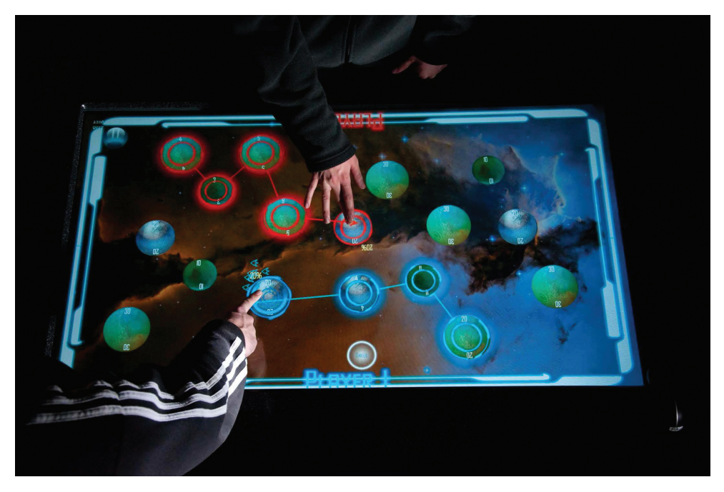
Fig. 3. Players mobilizing their spaceships for attack in Galaxy Commander with a simple drag gesture. Both players are linking planetary resources together across multiple planets to form a larger attack fleet.

technically recognized as "cheating", their spontaneity greatly enhanced the enjoyment of the game by the players.