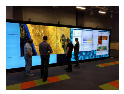
Figure 2. A multidisciplinary team of scientists is shown interactively exploring a 2048<sup>3</sup> voxel micro CT scan of a primate tooth. The left half of the large-scale tiled display is showing a high-resolution image of 3x3 tiles (total image size of 5760x3240 pixels) streamed from ANL's Cooley visualization cluster. A laptop running the interaction client is mirrored on the right half of the large display so the entire group can view the visualization parameters such as the transfer function, material properties, and light positions.

the motion capture data to track users during these tasks so that we can start to understand how researchers utilize the physical space in a MDE.