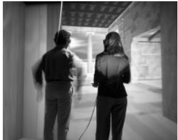
Figure 1: Miletus in the ReaCTor